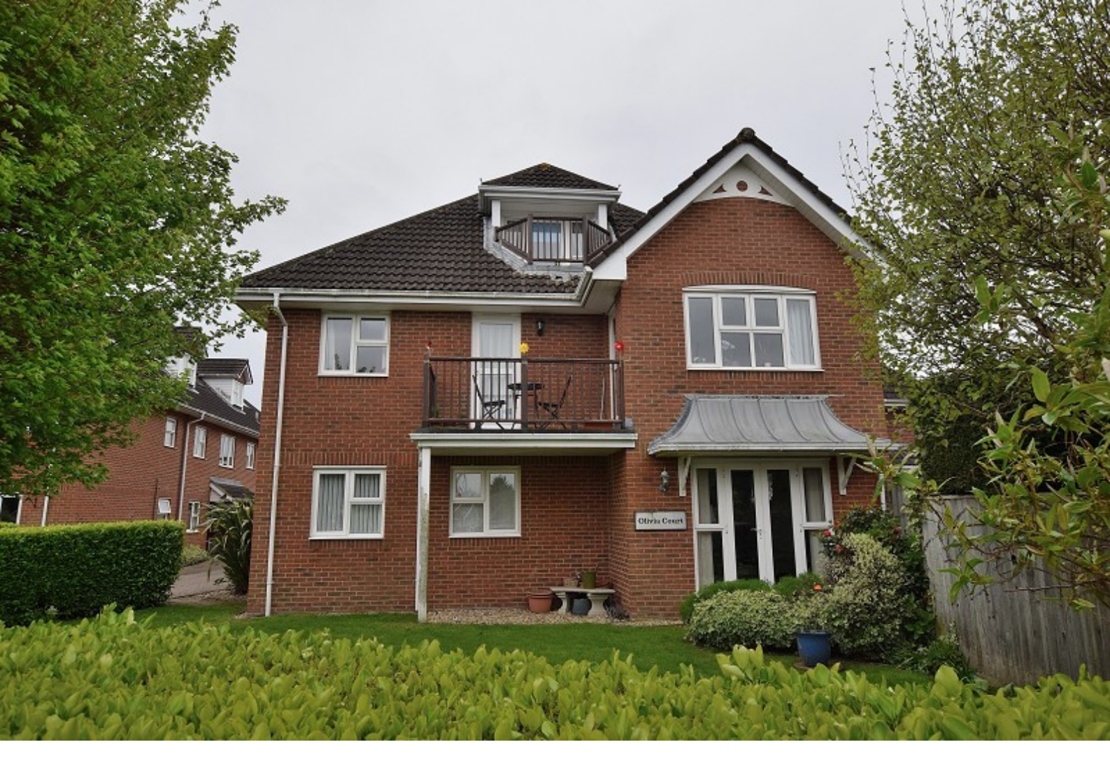
6 Olivia Court Station Road, New Milton, Hampshire. BH25 6LU £349,950