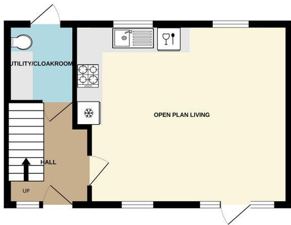
1ST FLOOR 357 sq.ft. (33.1 sq.m.) approx.