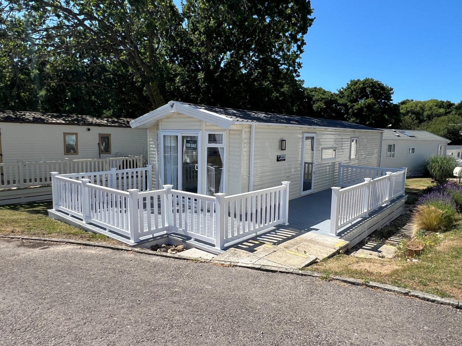
SB435 Willerby Brookwood Shorefield Country Park, Shorefield Road, Downton, Lymington, Hampshire. SO41 0LH Guide Price £88,995